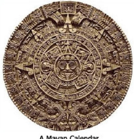
A Mayan Calendar

The Mayas had three main calendars.<sup>3</sup> One was a solar calendar that was based on 20 day months. The second was a ceremonial calendar that was related to the 260 day cycle of Venus. It was their third measure of time, the Long Count Calendar, that was related to the year 2012.